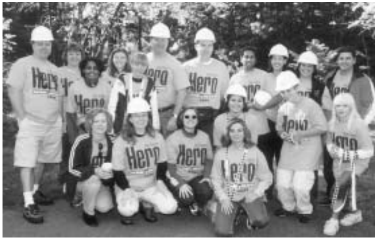
IFMA Jimmy Fund volunteers