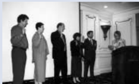
Our new Executive Board takes their pledge